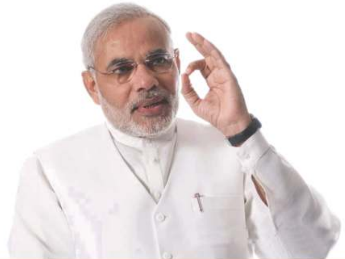
Honorable Prime Minister of India Shri Narendra Modi

It will be a new Gujarat, within Gujarat.